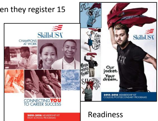
Readiness the SkillsUSA

SkillsUSA advisors will receive three educational resources when they register 15 student members plus one or more professional members by Nov. 15 . They will receive a copy of Ignite , a new resource designed around the SkillsUSA Framework with a variety of classroom activities that spark student engagement. They will also receive a copy of Jump into STEM! This new program teaches SkillsUSA members how to facilitate STEM workshops for elementary-school students. The downloadable curriculum includes instructions for running 22 activities for hands-on learning. The third free resource, free to paid professional members, is the Career Curriculum (CRC). This program supports the framework of mission, which includes personal, workplace and technical skills grounded in academics — all essential to a successful technical education and future workplace success. The CRC curriculum